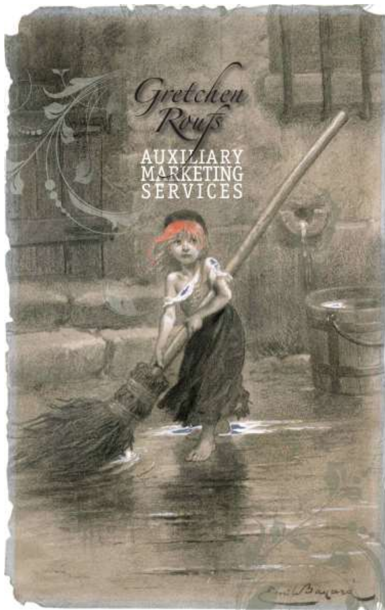
Illustration of Cosette in the Thénardières' inn at Montfermeil depicted by Émile Bayard (1837-1891).